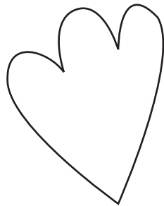
Feet Cut 2